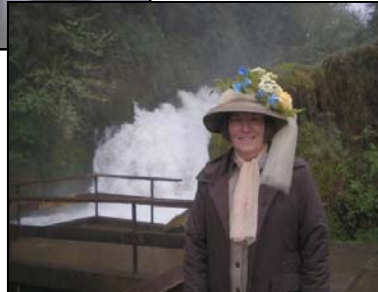
Right: Our roving reporter makes a pretty picture in front of the falls!