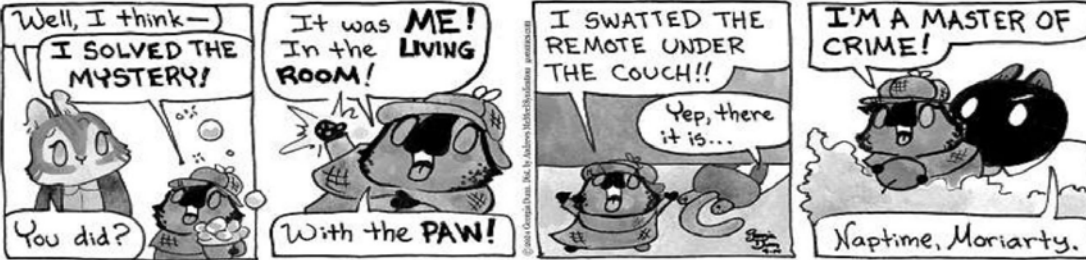
At left, below & below left: Submitted by SOB Bill Seil (Source: Seattle Times, 9/14/2024, 4/15/2024 & 11/6/2023)